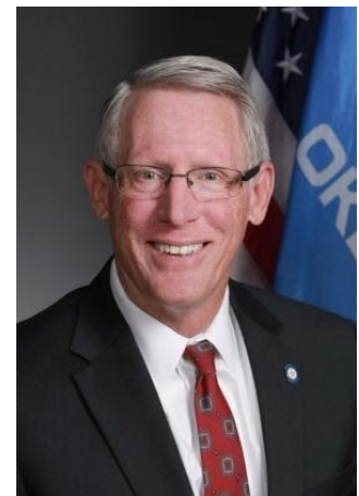
Senator Dave Rader-District 39