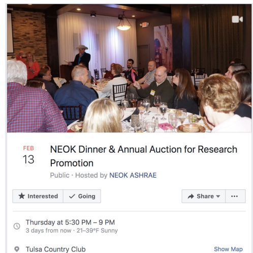
Example event reminder on Facebook