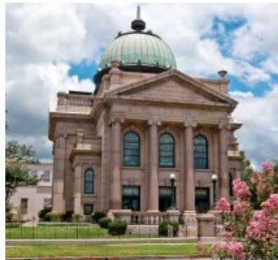
First Presbyterian Church