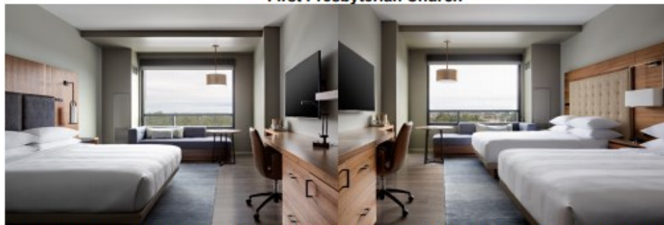
Standard Guest Rooms King Bed or Standard Dual Queen Bed $169.00/Night + Sales Tax and Use Tax

ASHRAE 125th Anniversary, HVAC&R Industry Pilot Historical Milestone Plaque Presentation April 26th, 2020 Houston Chapter ASHRAE Sponsoring Entity 2019-20 First Presbyterian Church 902 West Green Ave, Orange, Texas 77630