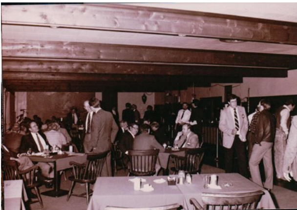
Socializing at a meeting.