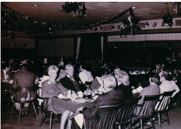
Meeting attendees sharing a meal.

Here are some photos of the Candlewood Club where we met a few years ago, in the 1980's and 1990's. Accommodations were great and food was also excellent, including steak at every meeting. Notice the average dress of the members, lots of suit and ties back then. We also averaged approximate 70 to 80 people in attendance. According to the Tulsa World, the Candlewood Club eventually closed in February 1996. See if you recognize anyone in these photos of various chapter meetings.