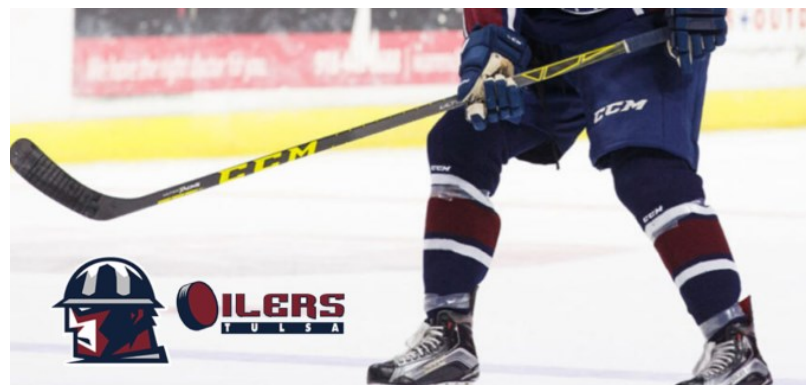
Last year, one of our YEA events was a hockey night cosponsored with the local chapter of ASPE.