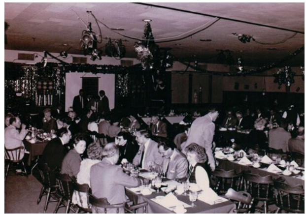
Meeting attendees sharing a meal.