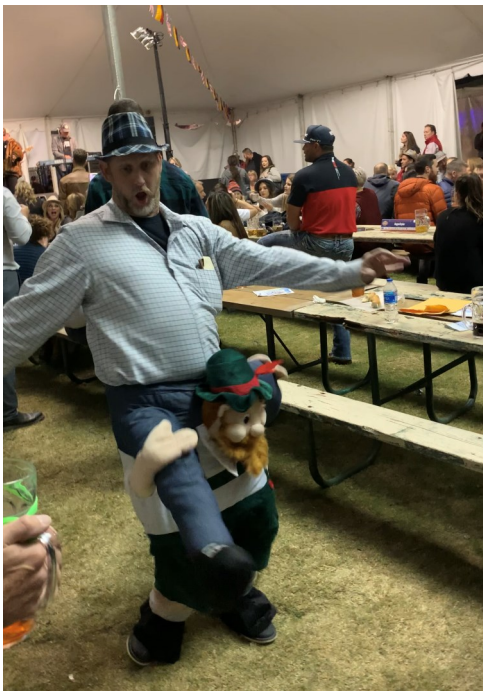
Oktoberfest 2019 brought out the best of the best

ASPE and NEOK ASHRAE have joined forces this year to reserve a table at the 2021 Linde Oktoberfest . All of the Details for YEA's upcoming Oktoberfest event have been ironed out and now all that is left to do is come hang out and enjoy an ice cold beer, some Authentic German Food and Entertainment, or even try your hand at the Beer Stein Holding Contest! Looking forward to seeing everybody at the event, feel free to reach out to me with any questions.