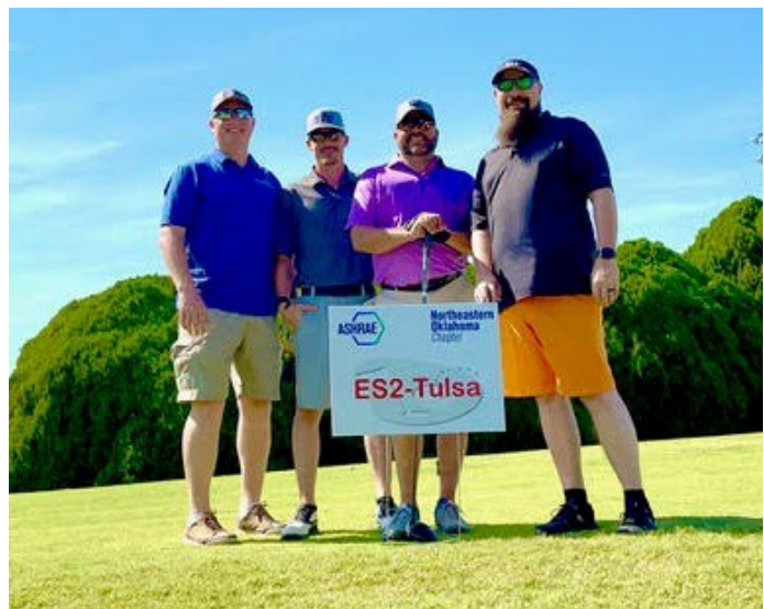
2022 ASHRAE Golf Tournament