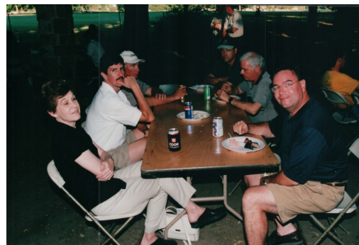
Some members enjoying BBQ