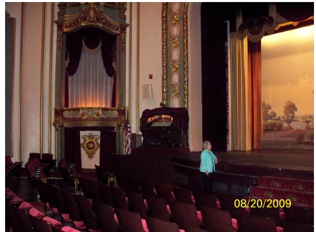
The stage and seating