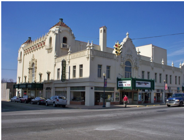
The Coleman Theater

I have included several photos I took, plus you can find out more info on their website . The theatre is listed by the historical society. If you get a chance, drive up and maybe you will get a tour of the facility.