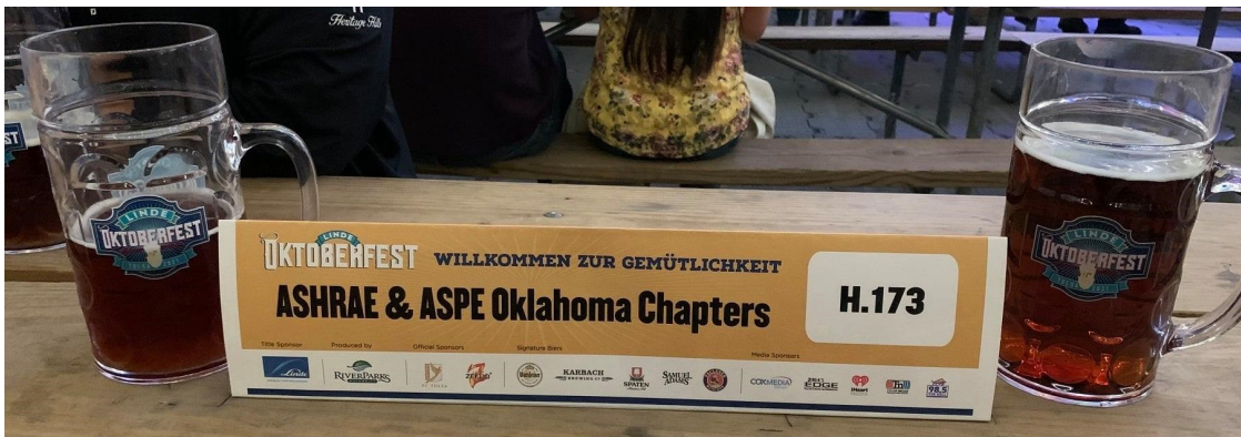
ASPE & ASHRAE Joining Together for some good fun!

YEA and ASPE's Oktoberfest event was a huge success! We sold out all tickets purchased and had a great time hanging out and enjoying the festival. We plan on keeping the momentum going with another event coming in December or early January, stay tuned and we hope to see you there!