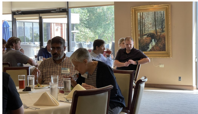
October meeting attendees enjoy lunch together