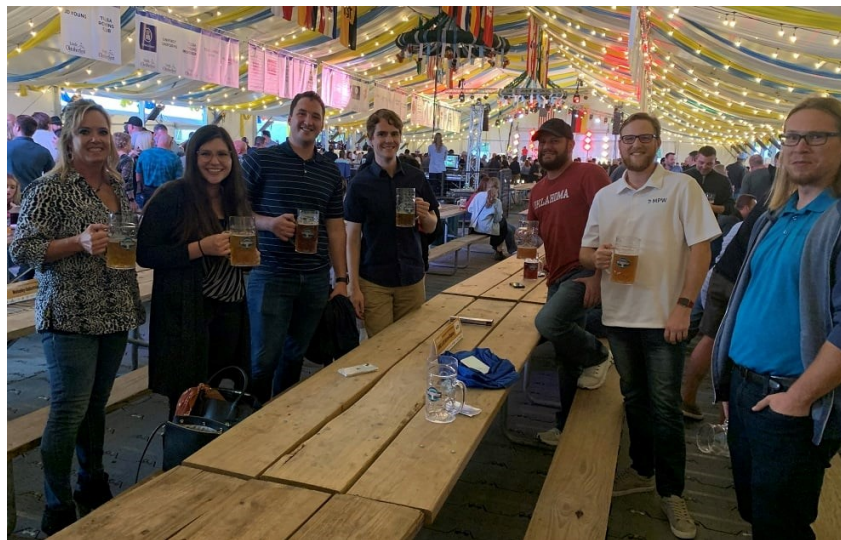
YEA Members showing their best beer stein pose