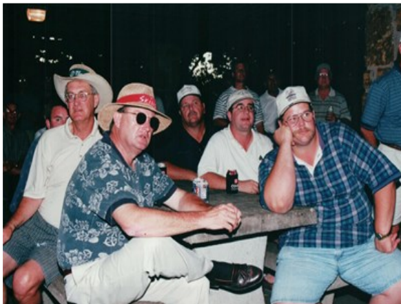
Chapter members listen to the program