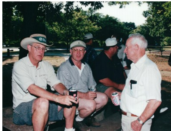
Chapter members socialize

This was the first year our chapter received a research donation qualifying for the Golden Circle, which was AAON. Later in the year our local MCAA joined with AAON to become the second local organization in the Golden Circle.