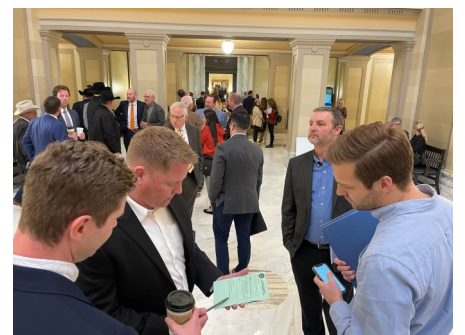
(COK chapter preparing

I have included pictures from our visit to the Hill. We are trying to coordinate an outreach meeting with some local school boards. Please reach out to me if you